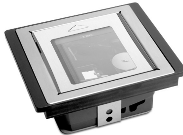
HSI250 Mount Kit (shown with scanner)